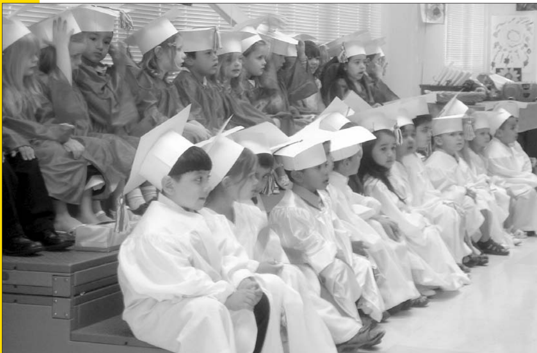
Graduates from Family Service League's model Universal Pre-K and preschool programs.