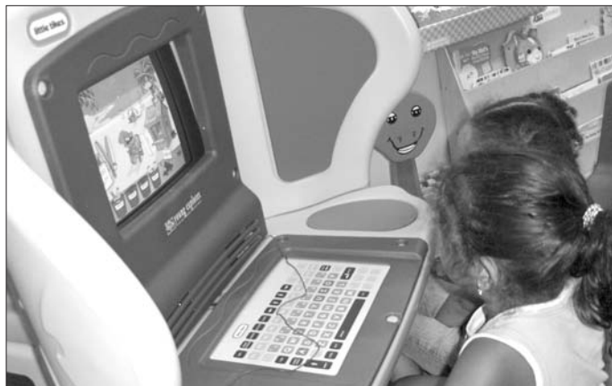
Universal Pre-K students enjoy one of six Young Explorer Computers that IBM donated to FSL.