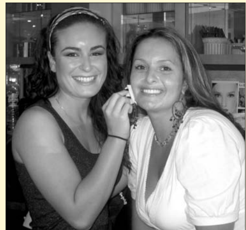
Cactus Salons donated the services of 58 employees to provide free makeovers for 41 FSL vocational clients.