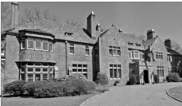
Lloyd Harbor's Panfield Mansion.