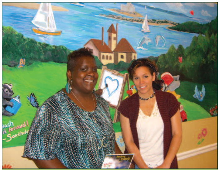
Thanks to the Southdown PTA of Huntington and Splashes of Hope, the Manor Field Family Center has a beautiful new mural of Huntington Harbor at their after-school program. The children enjoyed a field trip to the locations portrayed in the mural – Coindre Hall and Gold Star Beach.

The health home model places great emphasis on a multidisciplinary approach to care, where the focus is on medical/ behavioral health care providers consulting and communicating with one another to develop a single comprehensive care plan.