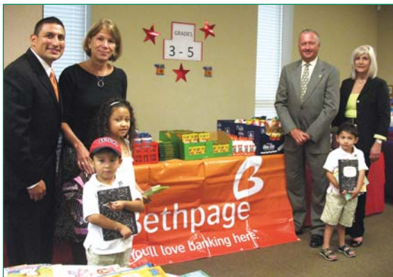
Bethpage Federal Credit Union was proud to help provide school supplies for children.

The Initial Teaching Alphabet Foundation generously continues to fund Project EASE with a grant of $49,200 for the 2010 – 2011 school year in Bayshore and Riverhead.