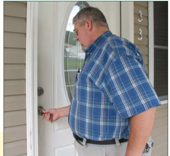
Each resident has a key to his new home.