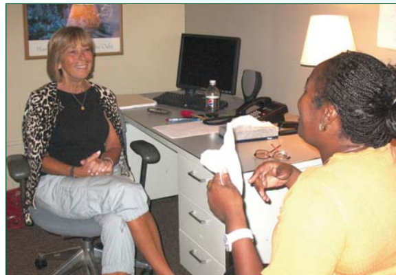
Families in crisis receive professional support and assistance at County Wide Counseling program.