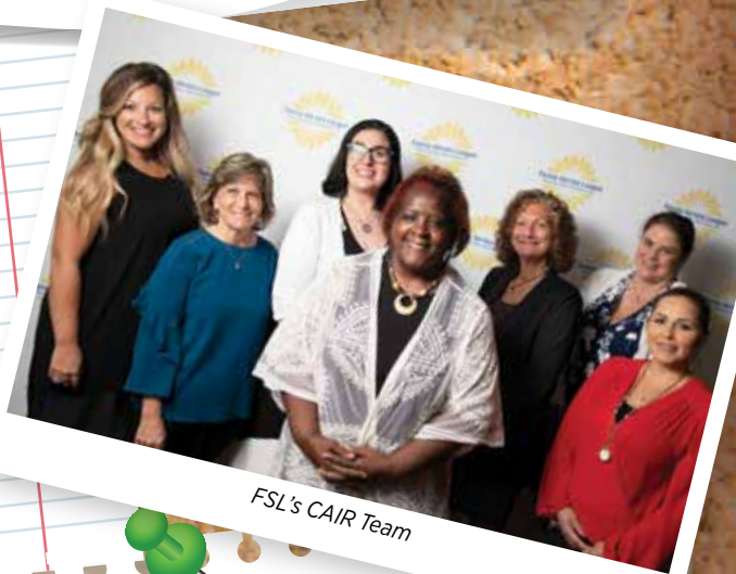
FSL's CAIR Team

FSL was able to successfully reduce the spread of COVID-19 during the peak of the pandemic by partnering with the Community Development Agencies (CDA) in the Towns of Brookhaven, Babylon, Islip, and Huntington . The CDA funding has been instrumental in reducing the spread of the virus to the very vulnerable, and often already medically compromised, population of children and adults who are coping with the trauma of homelessness. Over the past three years, the CDA partnerships allowed FSL to expand operations and improve services with the purchase of a wide array of PPE materials, equipment, renovations, and ventilation systems. These made a life-saving difference. By working together, we were able to help some of Suffolk County's most vulnerable children and adults reduce risk of exposure and enter safe housing shelters.