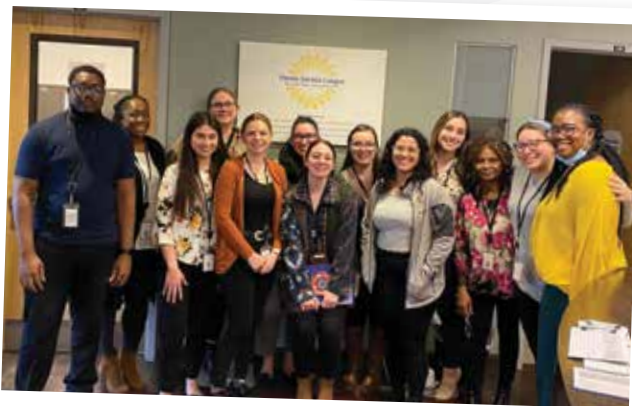
FSL's DASH Team

The Riverhead Community Awareness Program (CAP) is a non-profit community-based organization which was founded in 1979 to address growing problems caused by alcohol and other drugs within the Riverhead schools and community. Today, FSL collaborates with them on prevention work and provides Mental Health First Aid (MHFA) to the Riverhead community. MHFA training is designed to help non-professionals identify, understand, support, and refer someone who may be developing a mental health issue, substance use problem, or experiencing a crisis.