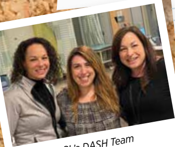
FSL's DASH Team

FSL's DASH crisis stabilization center has established a warm-handoff process with Stony Brook's Comprehensive Psychiatric Emergency Program (CPEP) and its adult inpatient psychiatric unit. DASH staff meet virtually with individuals who are being discharged from Stony Brook's programs to provide post-discharge follow up and our mobile crisis teams usually meet the patients within 24-hours of discharge. This coordinated process improves the continuity of care between the hospital and aftercare providers, which in turn leads to better follow up care for patients.